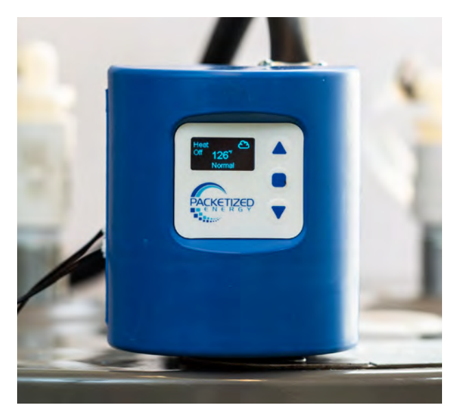
The Mello, a small device that fits on top of an electric resistance water heater, optimizes when the heater runs.

Currently, the program is open to members in the following towns: Bolton, Cambridge, Essex, Fairfax, Fletcher, Georgia, Grand Isle (town), Hinesburg, Huntington, Jeffersonville, Jericho, Milton, Richmond, St Albans, St George, South Hero, Starksboro, Underhill, Westford or Williston. This is so VEC can test the effectiveness of the technology in a concentrated area that can benefit the most